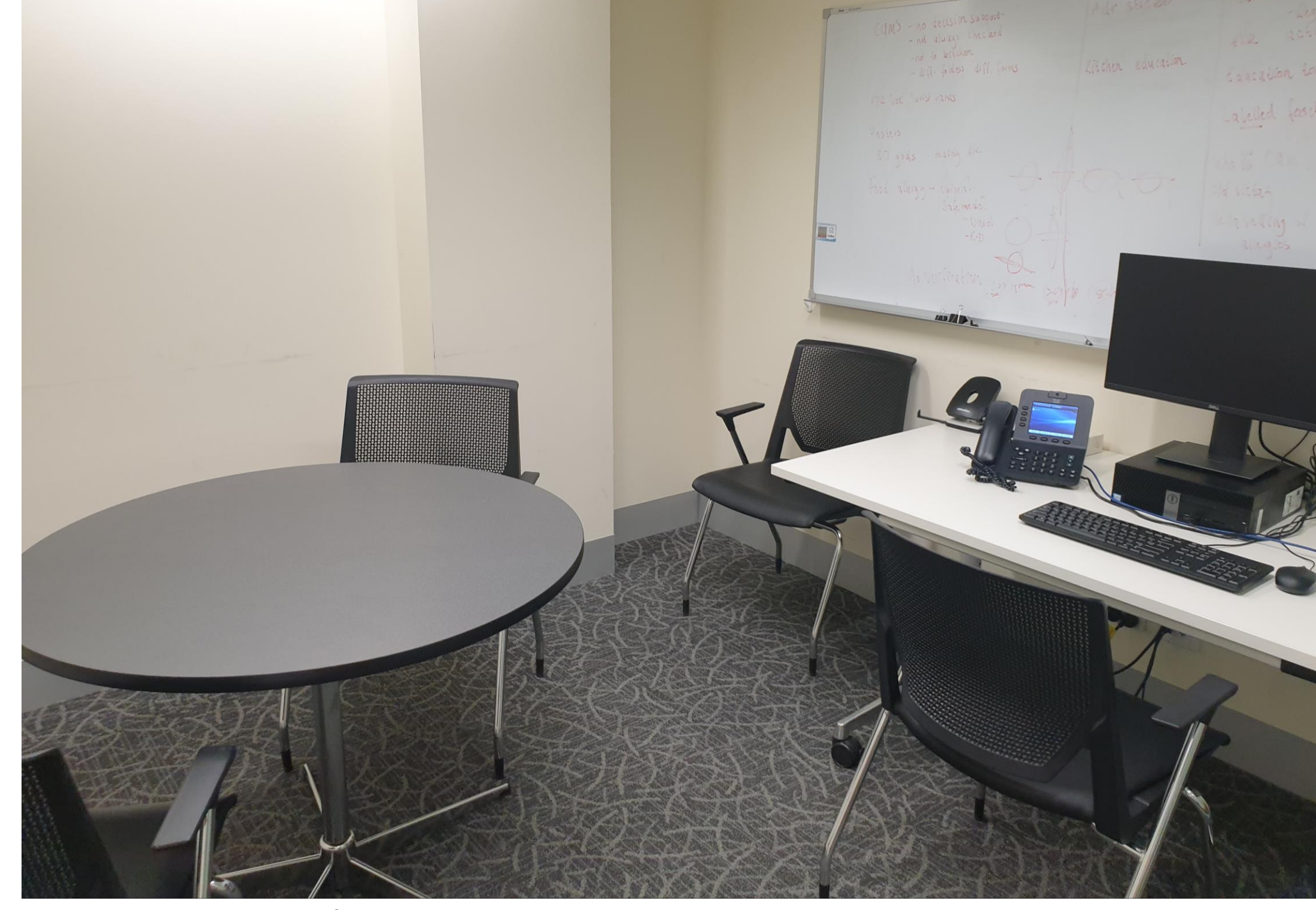
Private room for monitoring activities