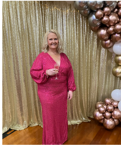
Dry July and A Ball