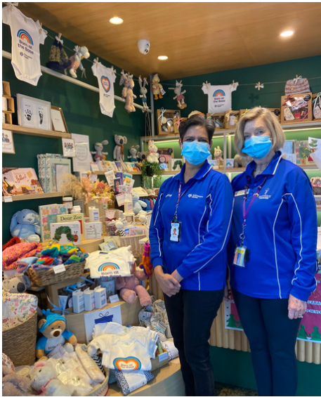
Volunteer Gift Shop