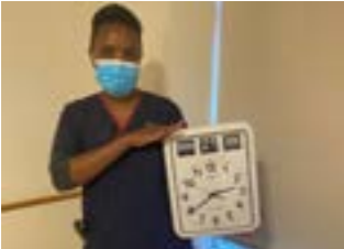
125 cognition–dementia clocks were purchased and hung throughout Ballarat Base Hospital.