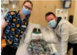
Smileyscope VR headset purchased for Paediatrics. The headsets are used to distract young patients during procedures.