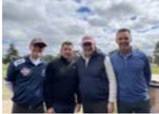
In April 2022 the Adroit Insurance & Risk Charity Golf Day returned after a two-year hiatus. Over $26,669 was raised for Speech Pathology programs.